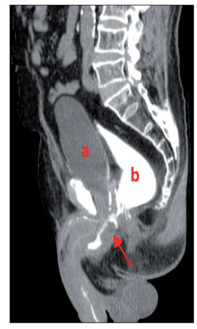
FIGURE 2: Computed tomography: a) bladder, b) rectum.

Written informed consent has been obtained from the patient for publishing this case.