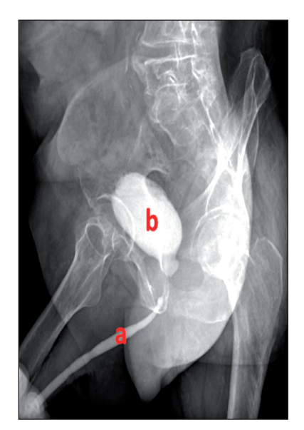
FIGURE 3: Postoperative 15<sup>th</sup> day retrograde urethrography: a) urethra, b) bladder.