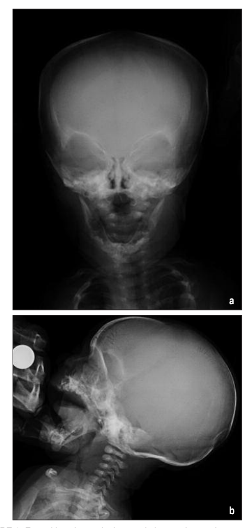
FIGURE 1: Frontal bossing and micrognatia is seen in anterior-posterior (a) and lateral cranial (b) radiograms.

Bone survey graphies consisting of X-rays of the skull, entire spine, chest, pelvis, bilateral upper and lower extremities were obtained. Cranial radiograms revealed frontal bossing and micrognatia (Figure 1a, b). There was postaxial polydactyly of both hands with short distal and middle phalanges compared to the proximal ones. Carpal development was delayed. Shortening and thickening was