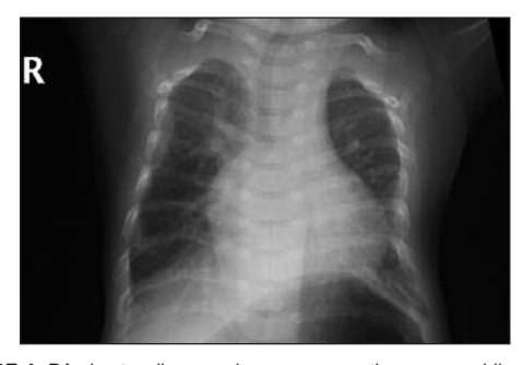
FIGURE 4: PA chest radiogram shows a narrow thorax resembling a bellshaped thorax with short thick ribs, underdeveloped lungs and an enlarged heart. PA: Posteroaxial.

were first degree coisins. 50-60% of the patients have congenital cardiac malformations, most frequently a single atrium or a atrioventricular (AV) defect, and the prognosis depends on the severity of cardiac defects along with respiratory insufficiency.<sup>10</sup> Our patients also received oxygen treatment and respiratory support after birth for a combination of meconium aspiration and underdeveloped lungs. She had multiple cardiac defects including single atrium and atrioventricular septal defect (AVSD) depicted by ECHO.