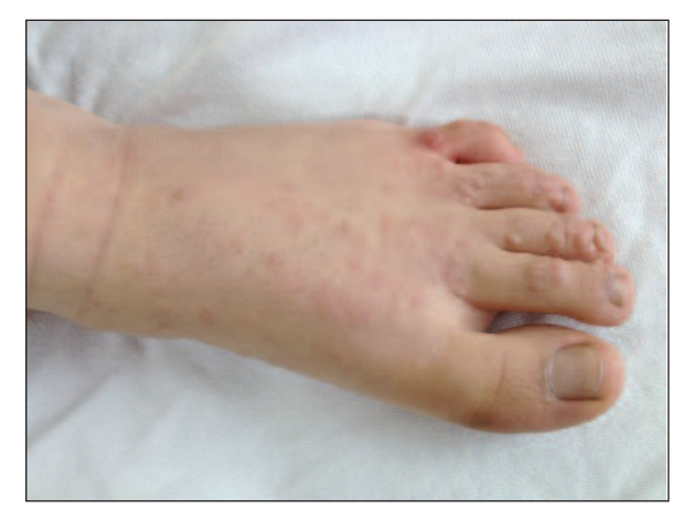
FIGURE 1: Skin colored nodules and papules on the medial side of left foot and distal portion of 2<sup>nd</sup>, 3<sup>rd</sup> and 4<sup>th</sup> toes and the proximal portion of 5<sup>th</sup> toe.

Multiple mucosal neuromas may be an early sign of multiple endocrine neoplasia syndrome type 2B (MEN2B). MEN 2B is charecterized by medullary thyroid carcinoma, pheochramocytoma and mucosal neuromas often localized to tongue, lip and buccal mucous membranes. Other symptoms are skeletal and ocular abnormalities. Skin and neural tissue anomalies can often be observed in PTEN hamartoma-tumor syndromes associated with PTEN tumor suppressor gene. PTEN hamartoma-tumor syndromes such as Cowden, Banayan-Riley-Ruvalcaba and Proteus like syndrome can be associated with neuromas. In Cowden syndrome tricholemmomas, oral papillomatosis,