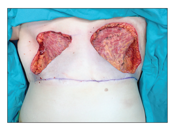
FIGURE 2: The appearance of the patient after mastectomies.

ance of the patient is shown in Figure 1, and the appearance of the patient after mastectomies is shown in Figure 2.