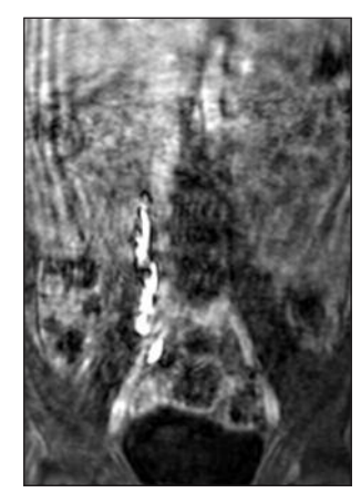
FIGURE 2: Magnetic Resonance Urography image for right retro-iliac ureter of second patient.